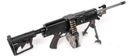
Next Generation Squad Weapons