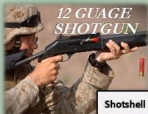
12 GAUGE SHOTGUN