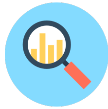
Systems & Analytics