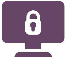
Networking & Security