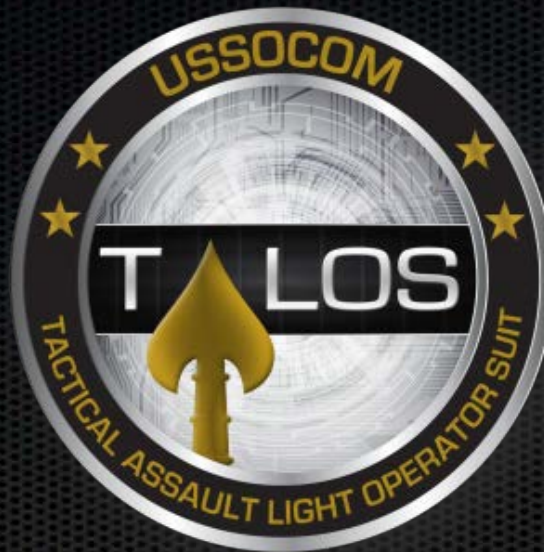
Tactical Assault Light Operator Suit