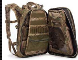
Medic Kit Configurations