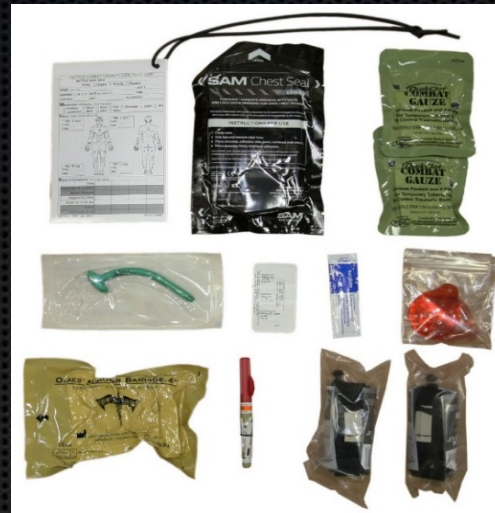
Operator Kit Items