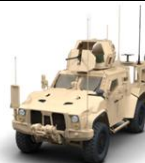
Heavy Guns Carrier AAO 2,388