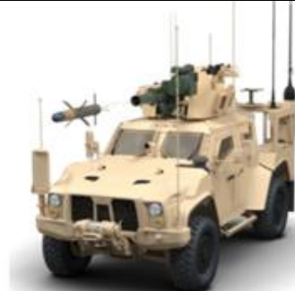
Close Combat Weapons Carrier AAO 459