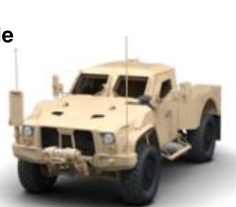
Utility AAO 949