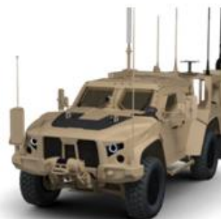
General Purpose AAO 1,704