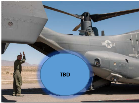
V-22 Internally Transportable Vehicle