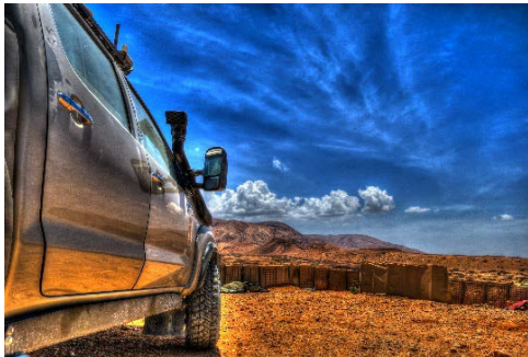
Purpose Built Non-Standard Commercial Vehicle