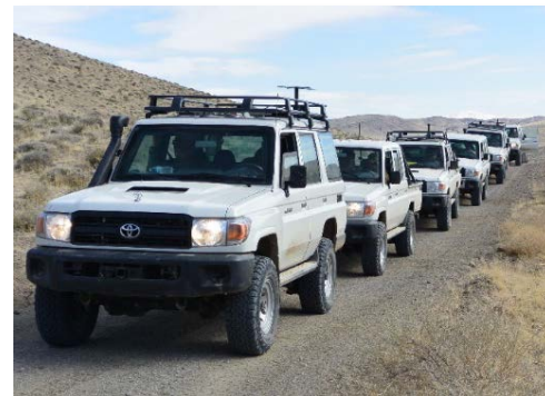
Non-Standard Commercial Vehicle