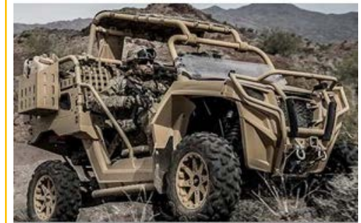
Light Tactical All Terrain Vehicle- Gas