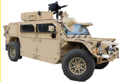
Ground Mobility Vehicle (GMV) 1.1