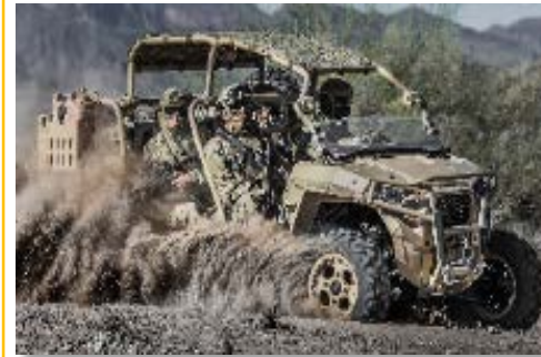
Light Tactical All Terrain Vehicle- Diesel