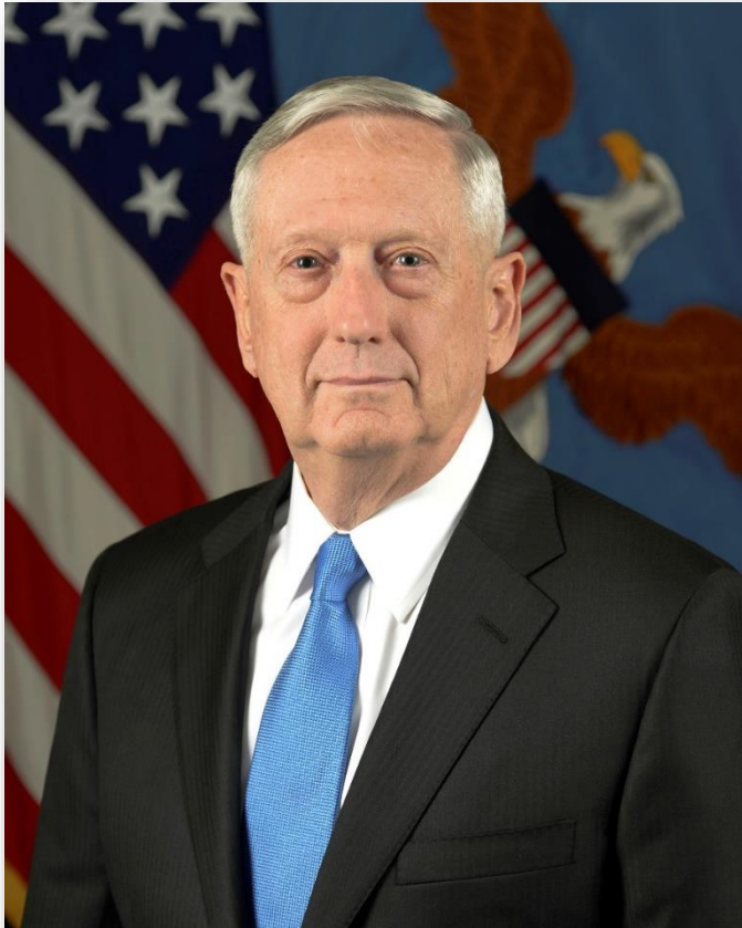
Remarks by Secretary of Defense James N. Mattis on the National Defense Strategy January 19, 2018

“To keep pace with our times, the department will transition to a culture of performance and affordability that operates at the speed of relevance.