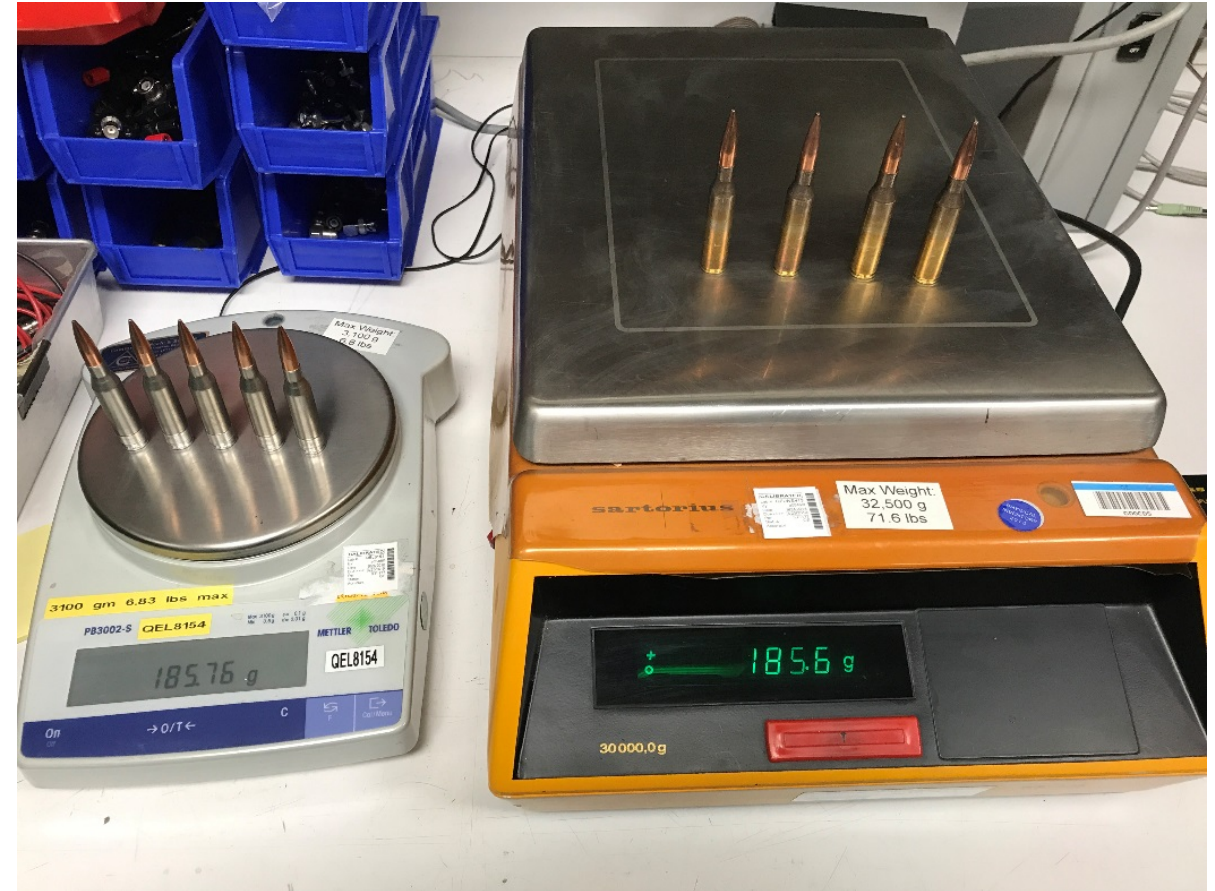
.338 Norma LW Machine Gun Cartridges