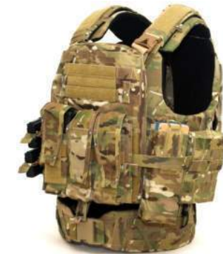
Body Armor Vests