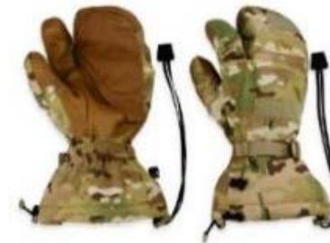
Modular Glove System