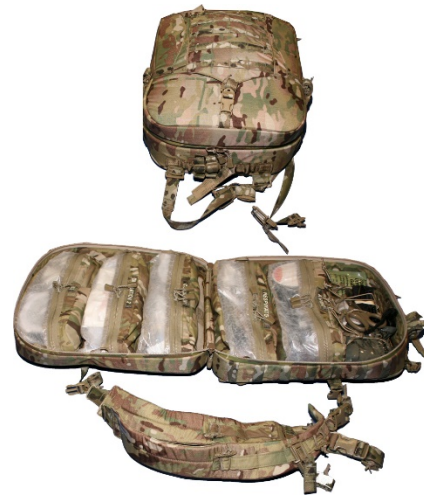
Medic Kit Bags