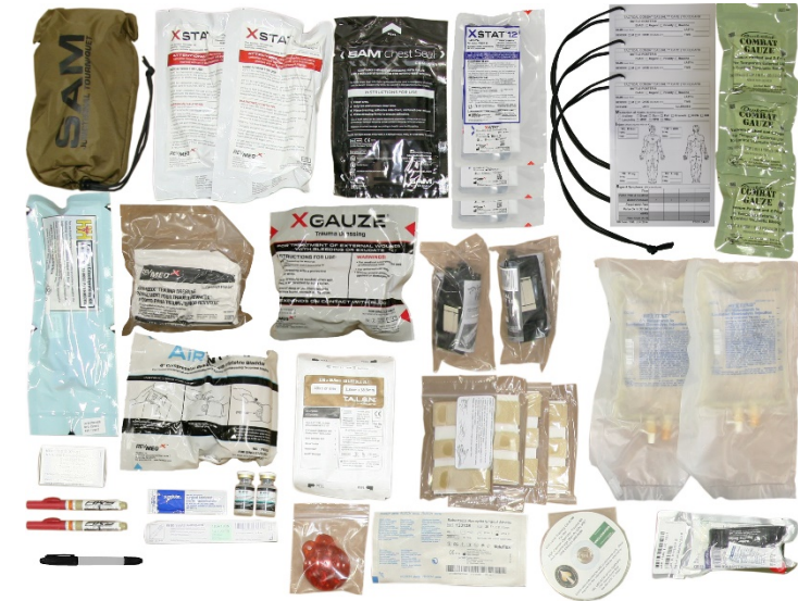
Medic Kit Items