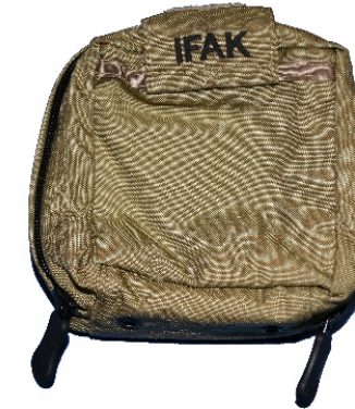
Operator Kit Pouch