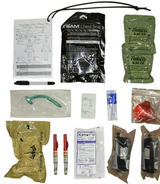
Operator Kit Items