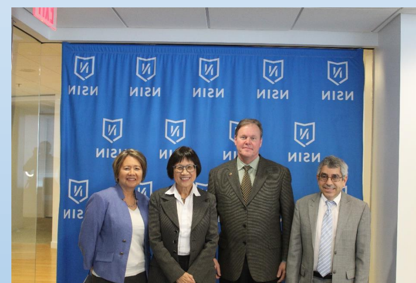
FY24 DOD S&T Budget Priorities Event