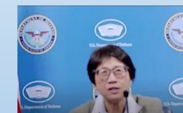
Emerging Tech Horizons Podcast Episodes