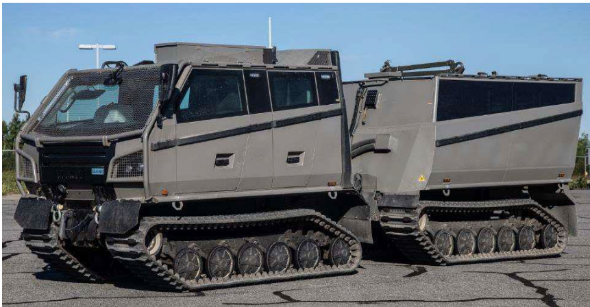
CATV General Purpose Vehicle