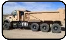
Heavy Dump Truck (HDT)

Enhanced Heavy Equipment Transporter System (EHETS)