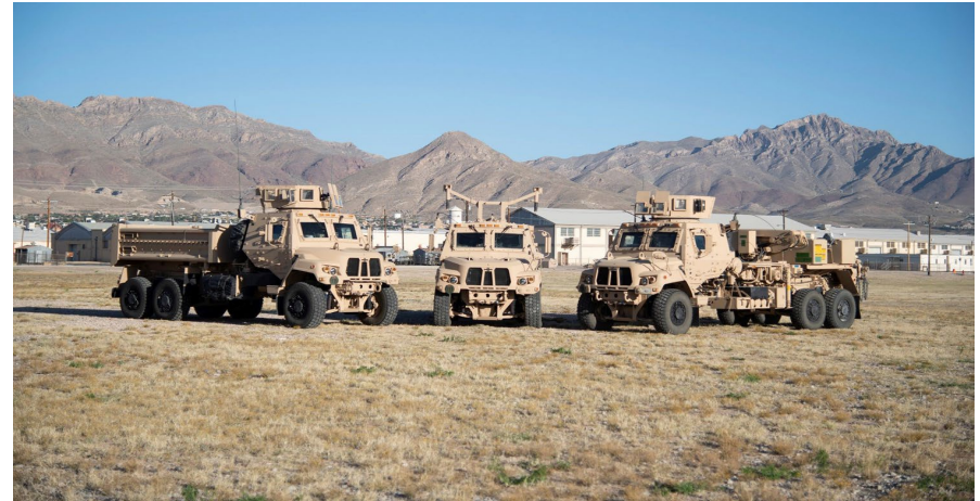
Family of Medium Tactical Vehicle A2