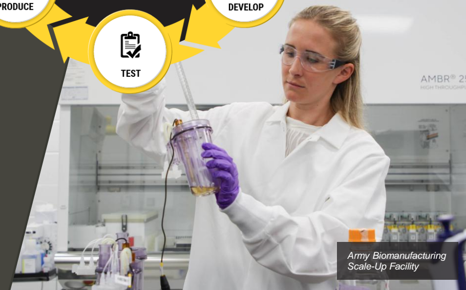
Army Biomanufacturing Scale-Up Facility