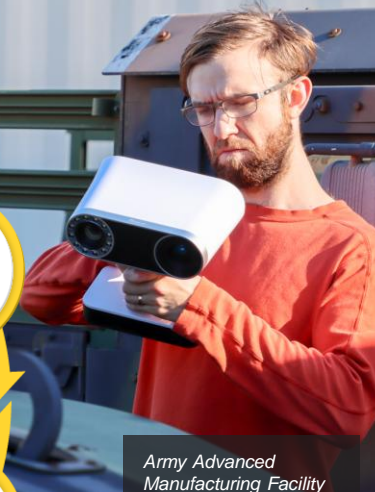
Army Advanced Manufacturing Facility